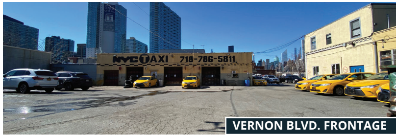
VERNON BLVD. FRONTAGE