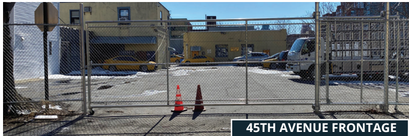
45TH AVENUE FRONTAGE

FLEET PARKING / AUTOMOTIVE / INDUSTRIAL - ALL USES CONSIDERED!